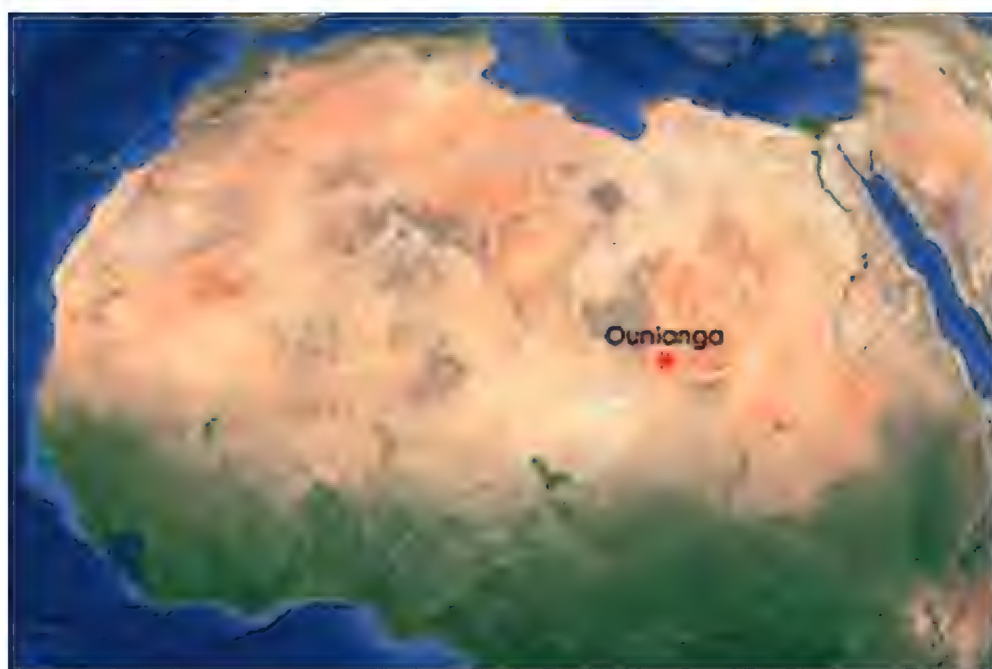
Fig. 1. Satellite view of the Sahara with location of Ounianga lakes (Chad).

Relict fish populations are known in several perennial bodies of waters of the Sahara desert, most of them located in mountainous massifs of central Sahara: the Adrar mountains in Mauritania, the Ahaggar, Tassili n'Ajjer and Mouydir in Algeria, and the Tibesti and Ennedi in Chad (Lévêque 1990, 2006; Trape 2009). Fish diversity is low, only two dozen of species have been recorded for the whole Sahara, and most species are known from a very low number of permanent water bodies, often from a single spring, guelta, pound or lake (Trape 2009). The number of species sharing the same water body usually ranges from one to three, with a maximum of four species