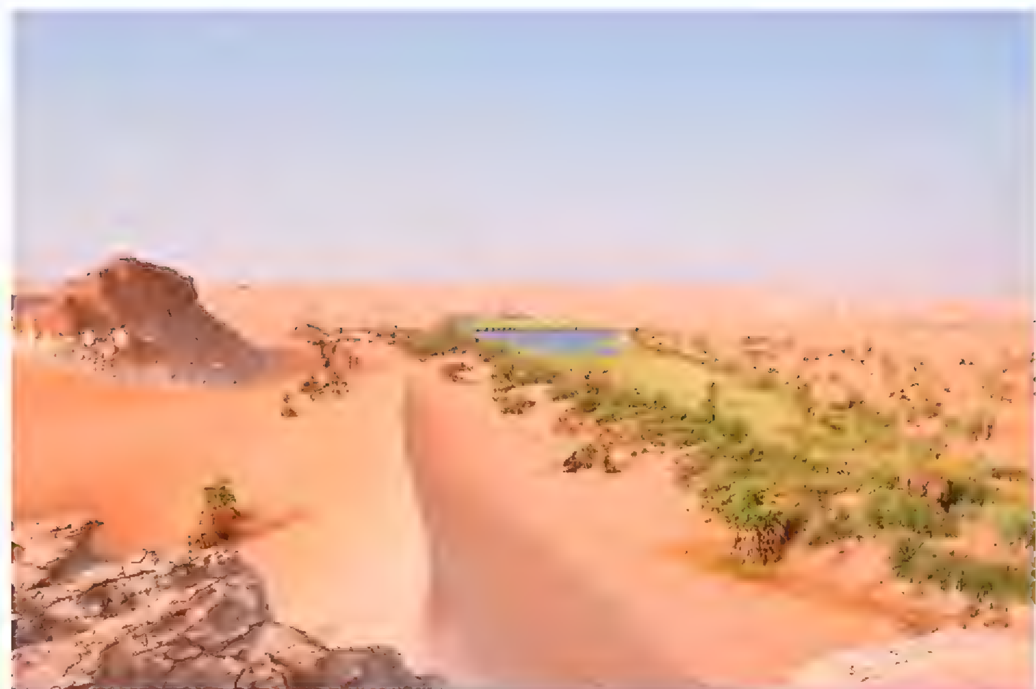
Fig. 4. View of Lake Boukou.

monocuspid. Upper profile of snout concave. Premaxilla extremely protrusible. Lower jaw distinctly prominent. Dorsal fin with 14 spines and 12 soft rays. Anal fin with 3 spines and 9 soft rays. Number of lateral-line scales: 29. Five dark blotches on sides, the first blotch confluent with the opercular spot, the fifth on caudal-fin base. Standard length 180 mm.