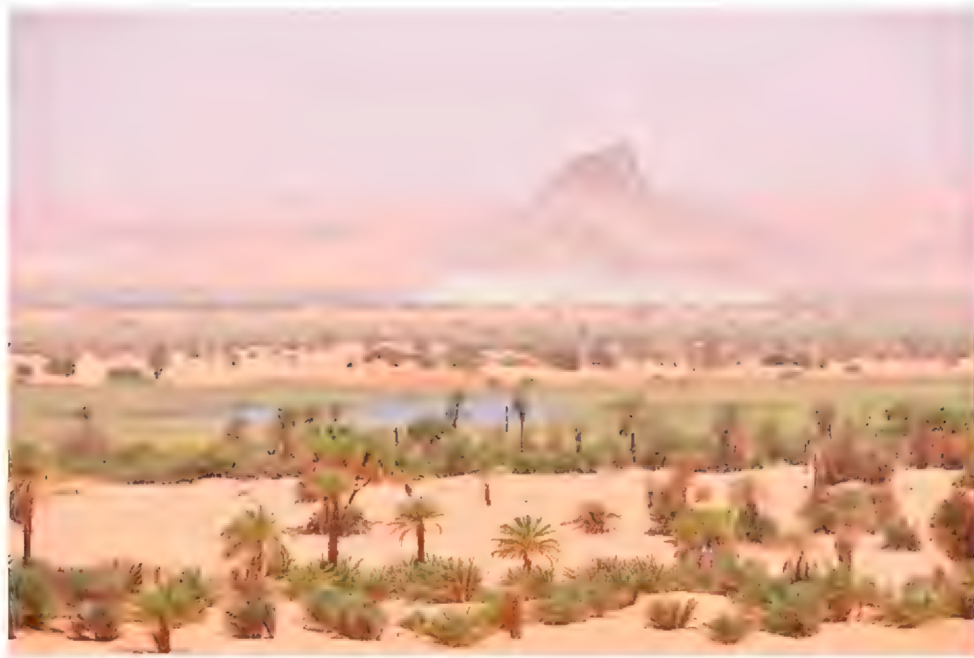
Fig. 6. View of Lake Djara.

Description. A tubular pre-ocular system with five pores. A frontal supra-orbital neuromast system consisting of one pit with two neuromasts. Dorsal fin 8–9 rays, anal fin 14–18 rays. Scales on mid-lateral series 26–27. Life colours of males (Fig. 5) are typical of this species (see Wildekamp & Van der Zee 2003) with in particular oblique red stripes on the opercle, a large number of oblique red bars on the sides and the back, a wide dark grey longitudinal band extending from the opercle to the caudal peduncle, and a number of red spots on the anal, dorsal and caudal fins. Standard length 37–39 mm.