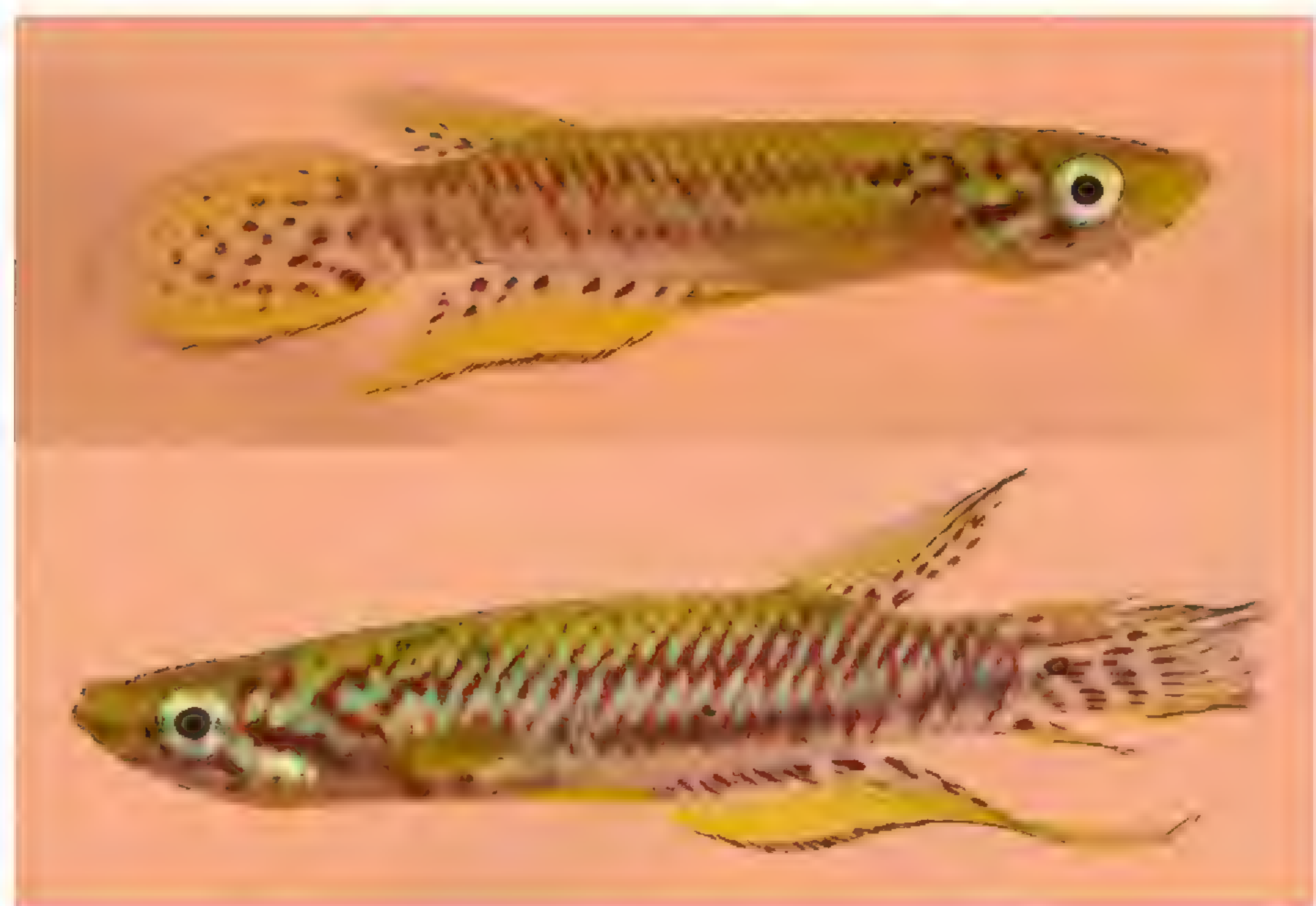
Fig. 5. Two specimens of Epiplatys bifasciatus from Lake Djara in life.

Material examined. MNHN 2016.0273, 5 specimens collected in Lake Djara (18°55'09"N, 20°53'39"E, elev. 355 m) (Fig. 6) on April 9 th 2016 by Jean-François Trape. Specimens were collected at night on the shore of the lake using a dipnet.